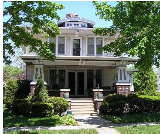
844 E. Pacific, corner of E. Pacific and N. Rankin in Appleton's current 3 rd Ward

If you have an ancestor who contributed to Appleton's history or was just plain interesting, please let us know. We would like to feature personal stories in future newsletters.