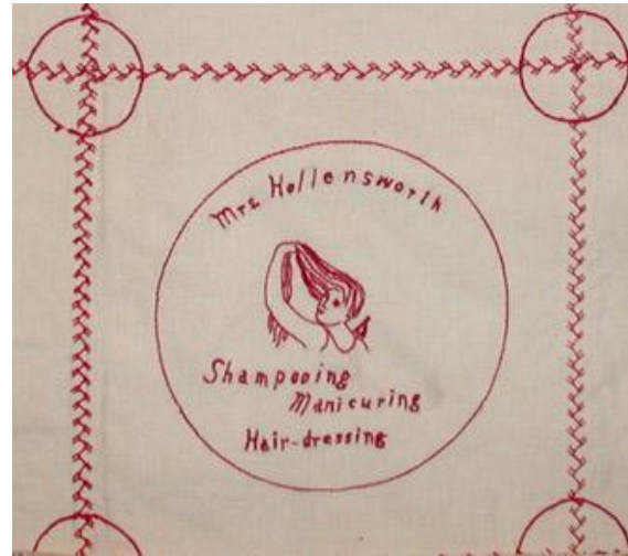
Square from a red work quilt, ca. 1900.