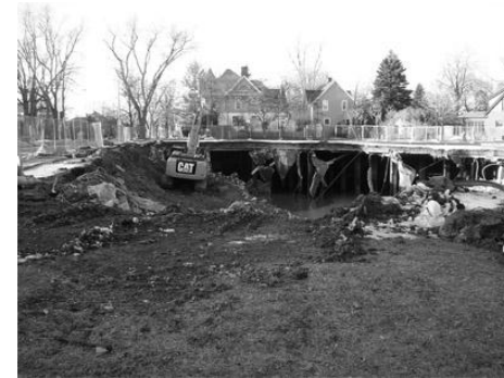
Remember April, 2013?

An immense amount of dirt requires removal, and the operation will be one needing some little time. The company is bound to push matters, however, and will get the reservoir ready for use in as short time as possible. The place looks rather desolate at present but when all is completed and the water in there will be a great transformation."