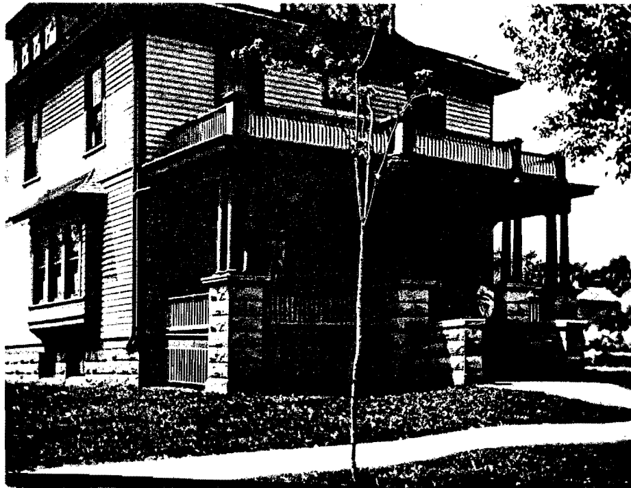
The Hauert Family Homestead on the corner of Walnut and Eighth circa 1915. (Now the site of the Chamber building.)

The Water Works Company has commenced work on the excavation of its reservoir upon the old Webb place. The large trees which covered the lot have been