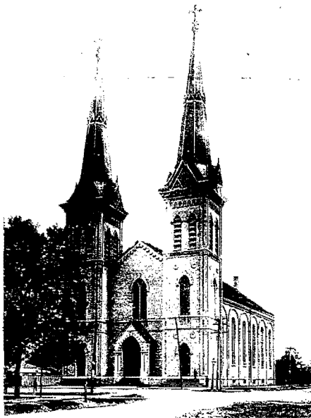
St. Mary's Church before the towers were shortened by wind storms.